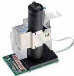
HP Optical Media Advance Sensor (OMAS)

Turn orders in record time with the fastest 60-inch production printer for graphics. 6 Offer exceptional color and black-and-white prints on many substrates with 8 HP Vivid Photo Inks. Count on advanced color management features backed by HP reliability and easy operation.