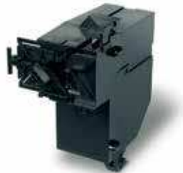
Spectrophotometer with i1 color technology from X-Rite