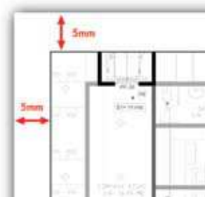
0.2 in (5 mm) margins