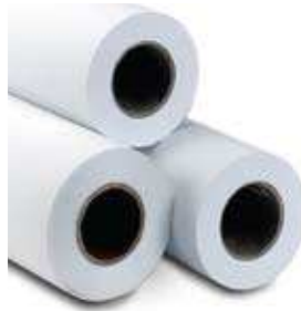
HP long media roll