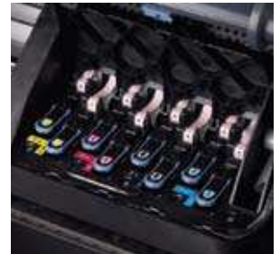
HP Double Swath Technology