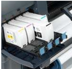
HP large black ink cartridge

(7 Compared to any HP Designjet 600/700/800/1000 Printer