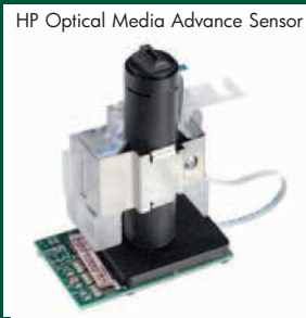
HP Optical Media Advance Sensor